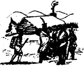
Onedias bringing several hundred bags of corn to Washington's starving army at Valley Forge, after the colonists had consistently refused to aid them.