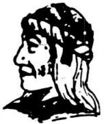
UGWA DEMOLUM YATENE Because of the help of this Oneida Chief in cementing a friendship between the six nations and the Colony of Pennsylvania, a new nation, the United States, was