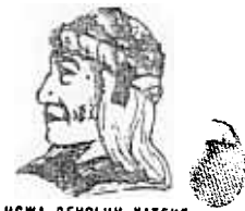
UGWA GEHOLUN YATENE Because of the help of this Oneida Chief in cementing a friendship between the six nations and the Colony of Pennsylvania, a new nation, the United States was made possible.