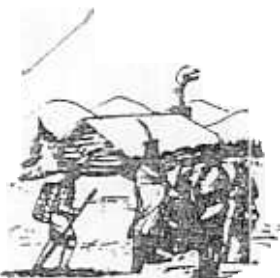
Onedias bringing several hundred bags of corn to Washington's starving army at Valley Forge, after the colonists had consistently refused to aid them.