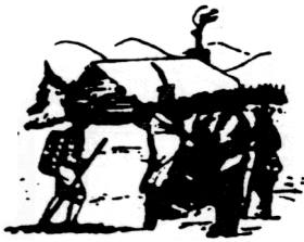
Oneidas bringing several hundred bags of corn to Washington's starving army at Valley Forge, after the colonists had consistently