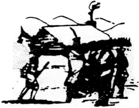
Oneidas bringing several hundred bags of corn to Washington's starving army at Valley Forge, after the colonists had consistently