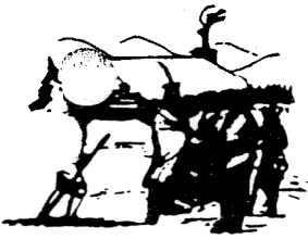
Oneidas bringing several hundred bags of corn to Washington's starving army at Valley Forge, after the colonists had consistently refused to aid them.