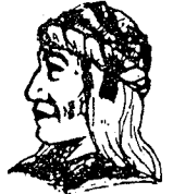
UGWA DEHOLUN YATEHE Because of the help of this Oneida Chief in cementing a friendship between the six nations and the Colony of Pennsylvania, a new nation, the United States was made possible.