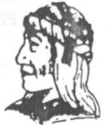
UGWA DEMOLUM YATEHI Because of the help of the Oneida Chief in cementing a friendship between the six nations and the Colon of Pennsylvania, a new nation the United States, was made possible.