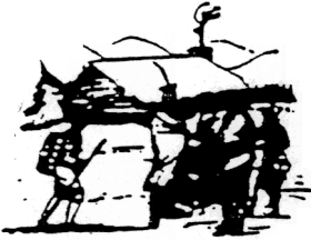
Oneidas bringing several hundred bags of corn to Washington's starving army at Valley Forge, after the colonists had consistently