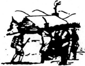
Oneidas bringing several hundred bags of corn to Washington's starving army at Valley Forge, after the colonists had consistently