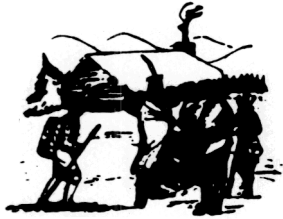
Oneidas bringing several hundred bags of corn to Washington's starving army at Valley Forge, after the colonists had consistently refused to aid them.