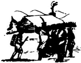
Oneidas bringing several hundred bags of corn to Washington's starving army at Valley Forge, after the colonists had consistently