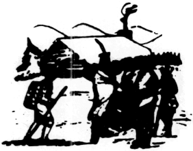
Oneidas bringing several hundred bags of corn to Washington's starving army at Valley Forge, after the colonists had consistently refused to aid them.