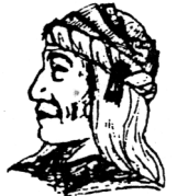
UGWA DEHOLUH YATENE Because of the help of this Oneida Chief in cementing a friendship between the six nations and the Colony of Pennsylvania, a new nation, the United States was made possible.