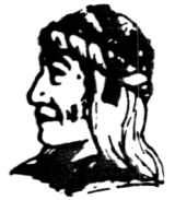
UGWA DEMOLUM YATEHE Because of the help of this Oneida Chief in cementing a friendship between the six nations and the Colony of Pennsylvania a new nation the United States was made possible