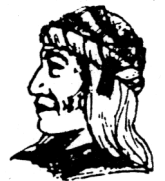
UGWA DENOLUX YATENE

Because of the help of this Oneida Chief in cementing a friendship between the six nations and the Colony of Pennsylvania, a new nation, the United States was made possible.