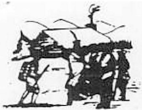
Oneidas bringing several hundred bags of corn to Washington's starving army at Valley Forge. After the colonists had consistently refused to aid them