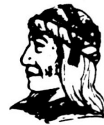
UGWA DEMOLUM YATEHE Because of the help of this Oneida Chief in cementing a friendship between the six nations and the Colony of Pennsylvania, a new nation, the United States was made possible