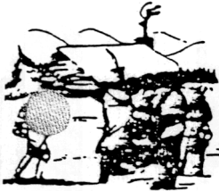
Oneidas bringing several hundred bags of corn to Washington's starving army at Valley Forge after the colonists had consistently refused to aid them