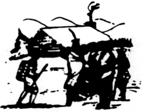
Oneidas bringing several hundred bags of corn to Washington's starving army at Valley Forge, after the refused to aid them