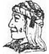
UGWA DENOLUH YATEHE Because of the help of this Oneida Chief in cementing a friendship between the six nations and the Colony of Pennsylvania, a new nation, the United States was made possible.