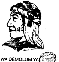
UGWA DEMOLUM YA Because of the help of Oneida Chief in cementing a friendship between the six nations and the Colony of Pennsylvania, a new nation, the United States, was made possible.