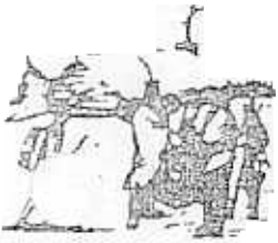
Oneidas bringing several hundred bags of corn to Washington's starving army at Valley Forge; after the colonists had consistently refused to aid them.